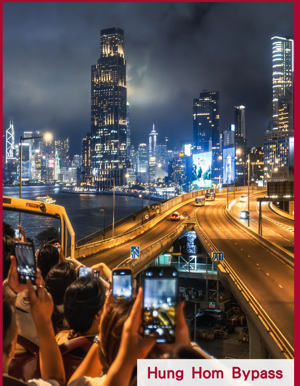
Hung Hom Bypass