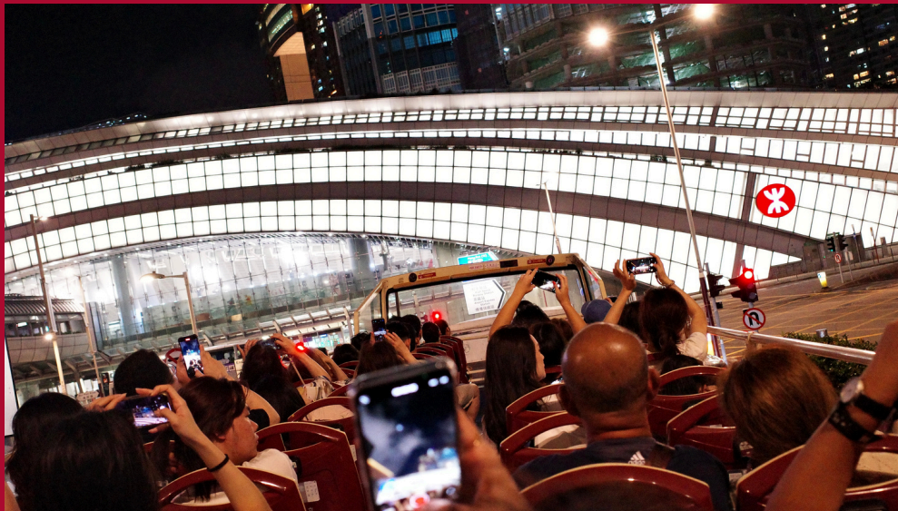
Hong Kong West Kowloon Station