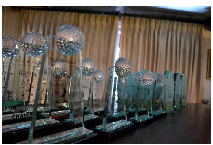
Trophies await winners