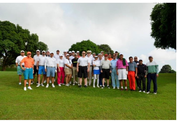
This year's tournament was participated in by 73 players.