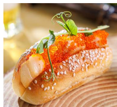
Savoury highlights (from left):

Crab and Avocado Salad Tartlet, Abalone Tartlet, Mini Scallop Bun